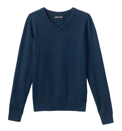
Boys Fine Gauge V-Neck Sweater* Classic Navy (logo required)