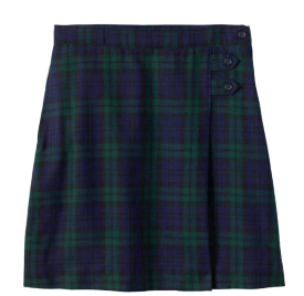
Girls A-line Skirt* Classic Navy/Evergreen Plaid