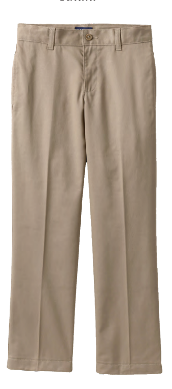
Boys Chino Pants Khaki