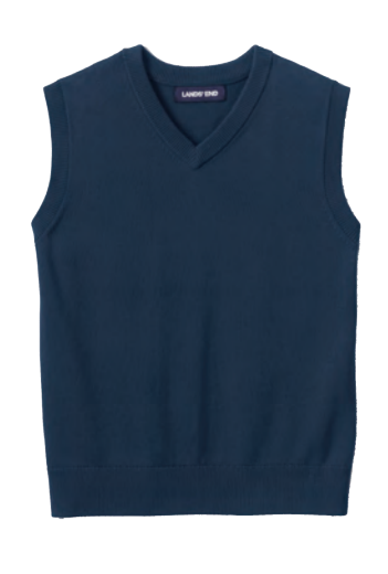
Fine Gauge Sweater Vest* Classic Navy (logo required)