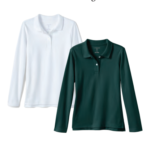
Long Sleeve Feminine Fit Polo Shirt White or Evergreen