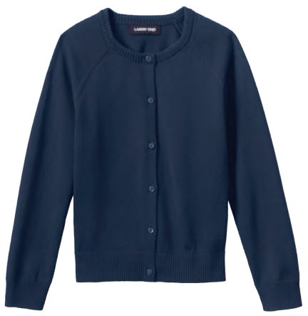
Girls Cardigan Sweater* Classic Navy (logo required)