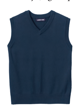
Fine Gauge Sweater Vest* Classic Navy (logo required)