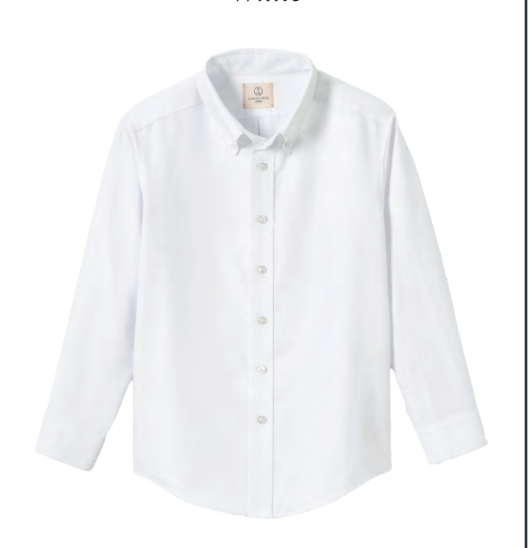
Boys Long Sleeve Solid Oxford Dress Shirt White