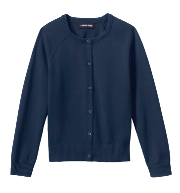
Girls Cardigan Sweater* Classic Navy (logo required)