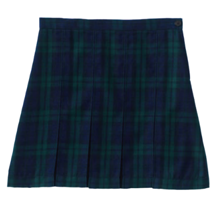
Girls Plaid Box Pleat Skirt* Classic Navy/Evergreen Plaid