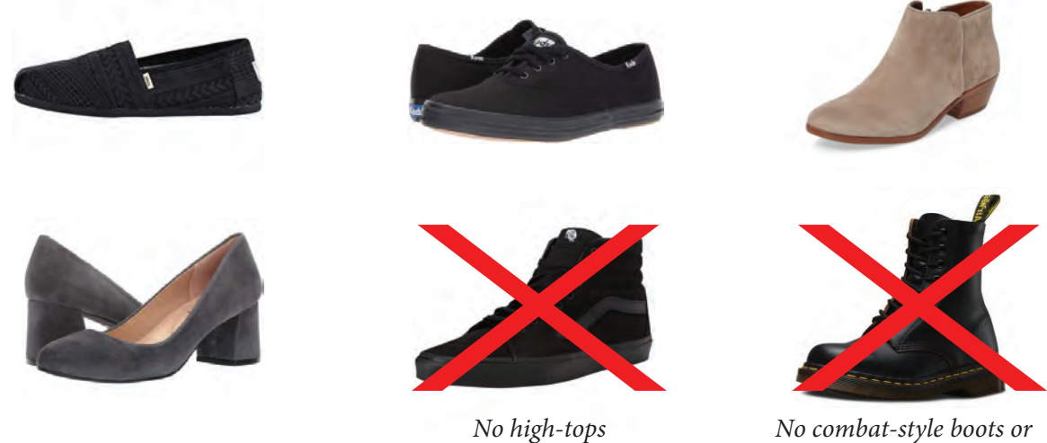
No combat-style boots or soles over 1.5"

Material: Leather, faux leather, suede, cloth.